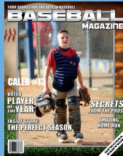
Magazine cover - $15