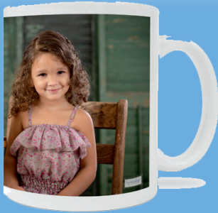
11oz. Ceramic Mug - $20