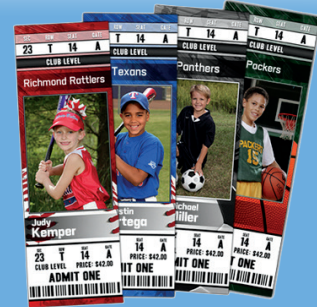
Sport ticket magnets (5) - $15

905 Old Railroad Grade Rd. Roan Mountain, TN 37687 423-817-9734 JRichPhotoInfo@gmail.com