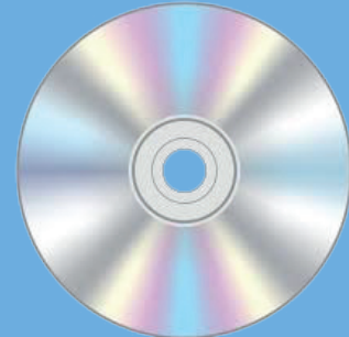
Digital images CD - $25

*Payment due on picture day. Cash, checks, and cards accepted. (card payments processed onsite - sorry no AMEX)