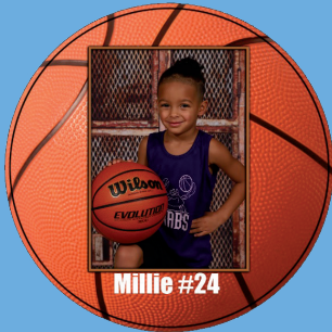
Ball plaque - $40

Order form with print and product packages on back. Add products to your package!*